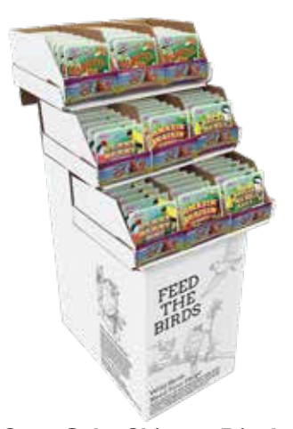
Suet Cake Shipper Display (4 Flavors)

Heavy-duty & easy-load. Holds our suet & mini seed cakes. Built-in hanger is designed to suspend the basket in a horizontal or vertical position, depending on the birds you're trying to attract.