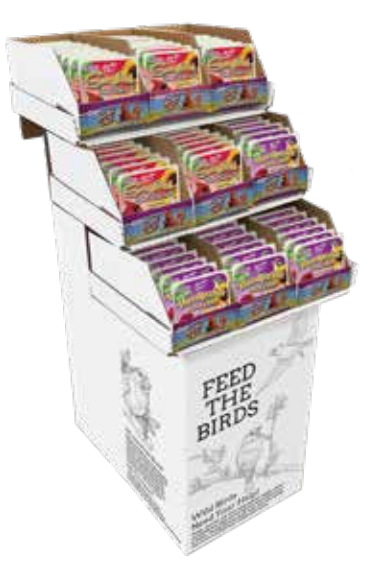
Seed Cake Shipper Display (2 Flavors)

Packed with sunflower seeds, peanuts, sunflower kernels, whole corn, papaya, almonds, safflower seeds and real honey.