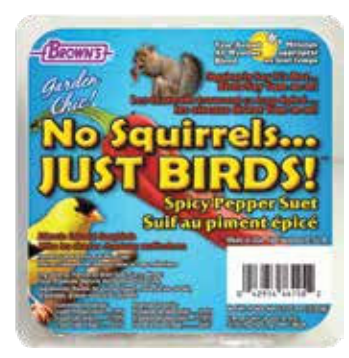
No Squirrels... Just Birds!™ Suet blended with cayenne and chili pepper flakes.