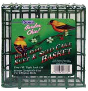
Wire Feeding Basket for Suet & Seed Cakes

Heavy-duty & easy-load. Holds our suet & mini seed cakes. Built-in hanger is designed to suspend the basket in a horizontal or vertical position, depending on the birds you're trying to attract.