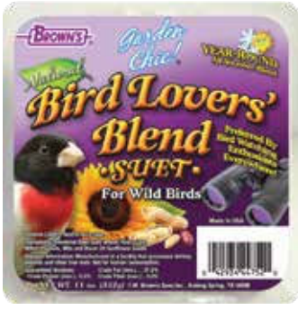
Bird Lovers' Blend™ Suet blended with dark oil sunflower seeds and peanuts.