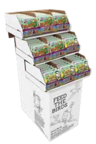
Suet Cake Shipper Display (2 Flavors)