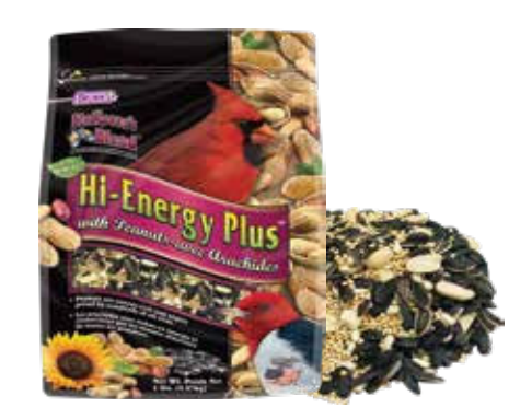
Hi-Energy Plus™with Peanuts A mix of white proso millet, black oil sunflower seeds, safflower and shelled peanuts

• Filler free blend attracts insect-eating birds · Mealworms are an excellent source of protein & fat