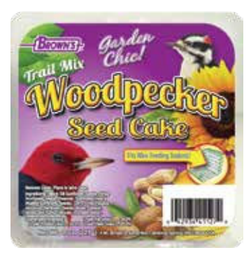
Trail Mix Woodpecker Seed Cake with Fruit & Nuts

A mixture of sunflower seeds, millet, cracked corn, peanut pieces, safflower seeds, papaya, almonds and real honey.