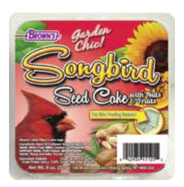
Songbird Seed Cake with Nuts & Fruits

Our seed cakes, hermetically sealed for freshness and no leaks, are made with real honey and mixed with a variety of seeds, real nuts and fruits. Designed for year-round feeding, they provide needed energy and fat for hard winter months and also for nesting birds in the spring. They all fit into our easy load wire feeding basket.