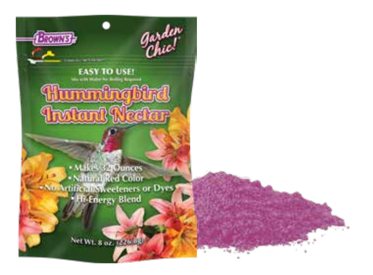
8 oz. Garden Chic!® Hummingbird Instant Nectar

Garden Chic!® Thistle Sock Instant Feeders comes pre-filled with Nyjer® (thistle seed). Thistle seed is the most desired seed of finches and other small birds. Simply unwrap and hang to create a goldfinch feeding frenzy! Once depleted, loosen the drawstring and refill.