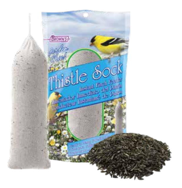
13 oz. Garden Chic!® Thistle Sock Instant Finch Feeder

Discourage those furry little "felons" from eating out of your wild bird feeders! Fire Mix is an all-natural, easy-to-use, and inexpensive way to keep squirrels and chipmunks away from your bird feeders when mixed into wild bird seed. Wild birds love the hot taste of peppers but squirrels don't!