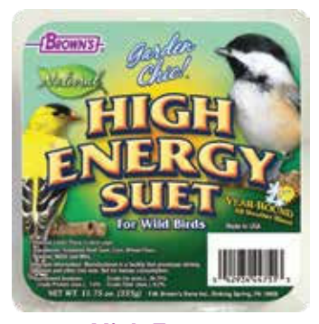
High Energy Suet blended with corn, peanuts, millet and milo.