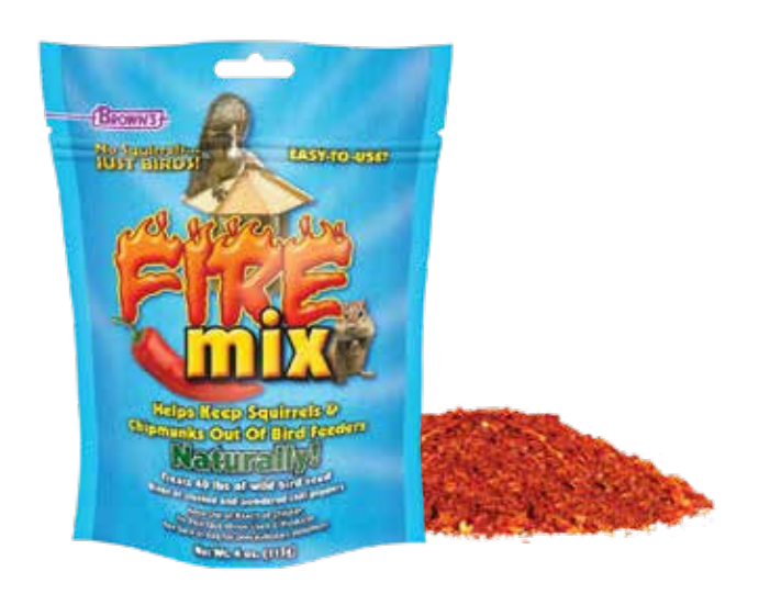
4 oz. Fire Mix Additive

Helps keep squirrels & chipmunks out of bird feeders naturally!