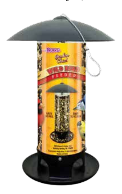
1.5 lb. Capacity Garden Chic!® Wild Bird Feeder Easy to fill... easy to clean!

Attract nature's beautiful hummingbirds to your backyard and gardens with Brown's® Garden Chic!® Hummingbird Instant Nectar. Our quick and easy-touse, hi-energy nectar uses natural carmine to create its distinctive red color, not artificial dyes. Simply mix Garden Chic!® Hummingbird Instant Nectar with tap water. No boiling is required.