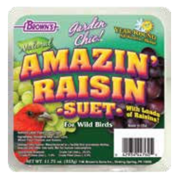
Amazin' Raisin Suet blended with peanuts and loads of raisins.