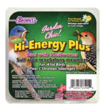
Hi-Energy Plus™ with Mealworms Suet blended with dried mealworms.