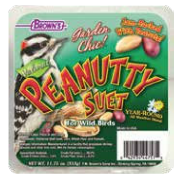
Peanutty Suet blended with peanuts.