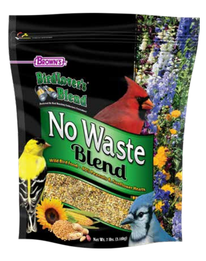
No Waste Blend

A mixture of sunflower kernels, shelled peanuts, white proso millet and cracked corn. Less mess and clean-up.