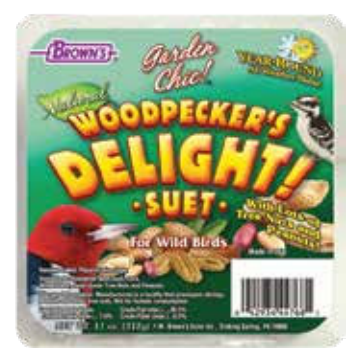
Woodpecker's Delight! Suet blended with peanuts, walnuts and almonds.

Our suet cakes, hermetically sealed for freshness and no leaks, are made with pure, fresh suet mixed with a variety of seeds, real nuts and fruits. Designed for year-round feeding, they provide needed energy and fat for hard winter months and also for nesting birds in the spring. They all fit into our easy load wire feeding basket.