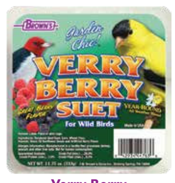
Verry Berry Suet blended with blueberries and raspberries.