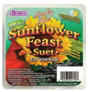
Sunflower Feast Suet blended with dark oil sunflower seeds.