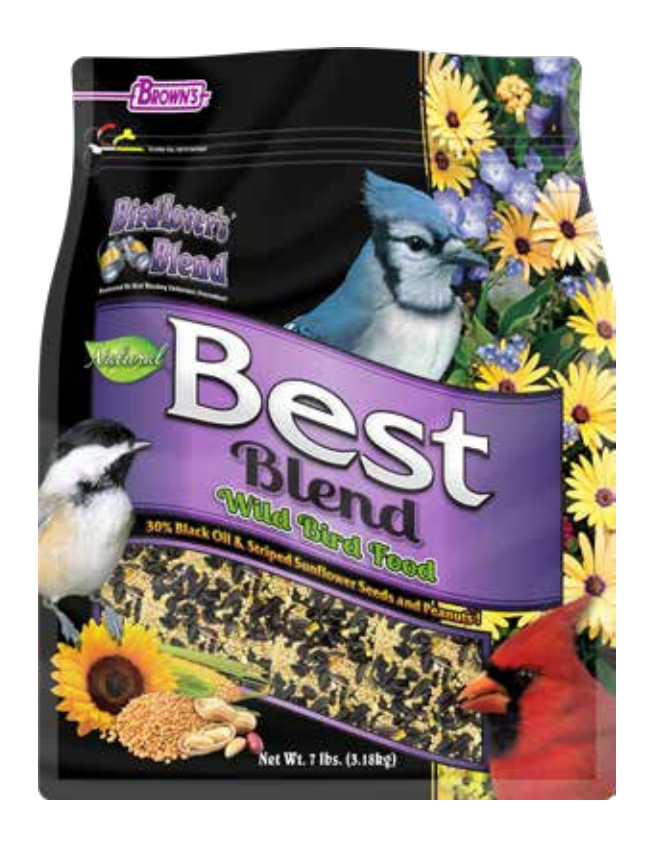
Best Blend Contains over 28% striped & black oil sunflower seeds

Want to get started into the wild bird business? Brown's® has the solution for you!