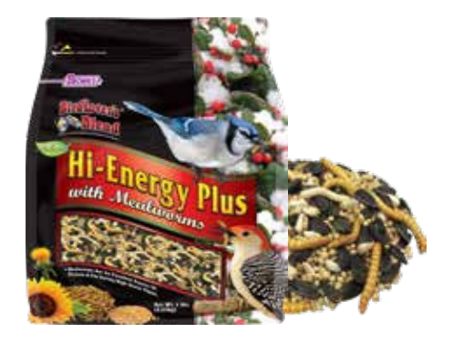
Hi-Energy Plus™ with Mealworms A mix of white proso millet, black oil sunflower seeds, safflower and freeze-dried mealworms.

Our survival blends are specifically formulated to help birds survive in difficult situations throughout the year. Wild birds require specialized diets high in energy and fats during migration, breeding, and the cold winter months. We've created a unique selection of to help wild birds thrive during these stressful times.