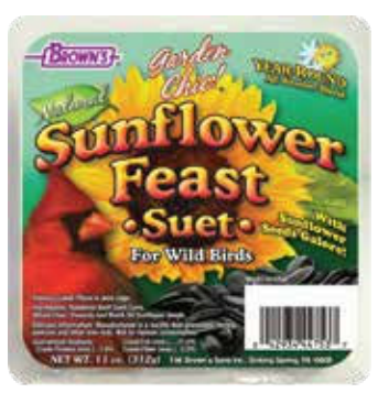
Sunflower Feast Suet blended with dark oil sunflower seeds.