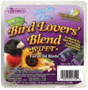
Bird Lovers' Blend™ Suet blended with dark oil sunflower seeds and peanuts.