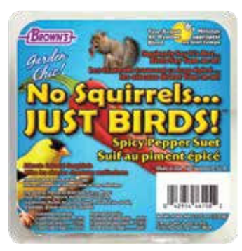
No Squirrels... Just Birds!™ Suet blended with cayenne and chili pepper flakes.