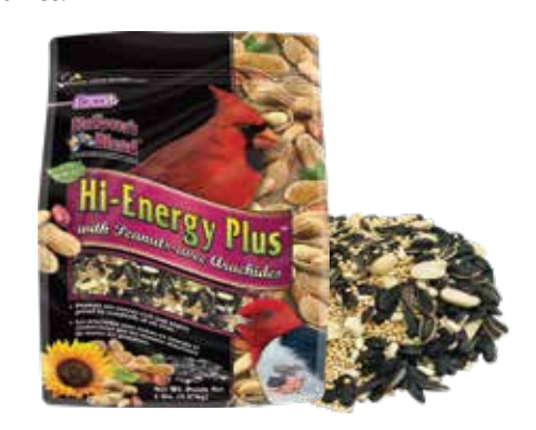
Hi-Energy Plus™with Peanuts A mix of white proso millet, black oil sunflower seeds, safflower and shelled peanuts

• Filler free blend attracts insect-eating birds • Mealworms are an excellent source of protein & fat