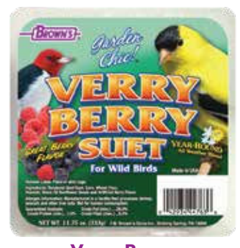
Verry Berry Suet blended with blueberries and raspberries.