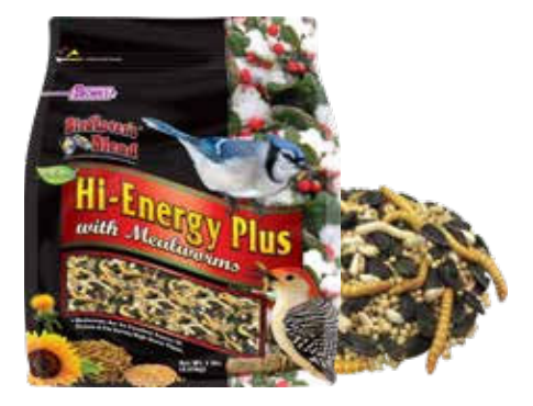
Hi-Energy Plus™ with Mealworms A mix of white proso millet, black oil sunflower seeds, safflower and freeze-dried mealworms.

Our survival blends are specifically formulated to help birds survive in difficult situations throughout the year. Wild birds require specialized diets high in energy and fats during migration, breeding, and the cold winter months. We've created a unique selection of to help wild birds thrive during these stressful times.