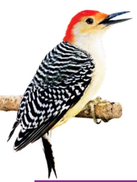
Hi-Energy Plus™ with Mealworms Suet blended with dried mealworms.