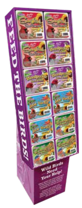
Seed Cake Shipper Displays (4 Flavors)

Packed with millet, sunflower seeds, safflower seeds, dried mealworms and real honey.