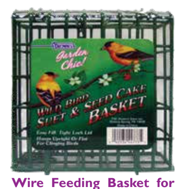
Suet & Seed Cakes Heavy-duty & easy-load. Holds our suet & mini seed cakes. Built-in hanger is designed to suspend the basket in a horizontal or vertical position, depending on the birds you're trying to attract.