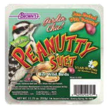
Peanutty Suet blended with peanuts.