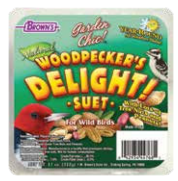
Woodpecker's Delight! Suet blended with peanuts, walnuts and almonds.

Our suet cakes, hermetically sealed for freshness and no leaks, are made with pure, fresh suet mixed with a variety of seeds, real nuts and fruits. Designed for year-round feeding, they provide needed energy and fat for hard winter months and also for nesting birds in the spring. They all fit into our easy load wire feeding basket.