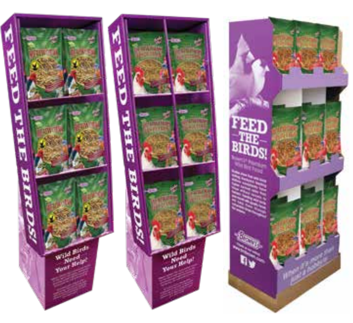
3, 7 & 14 oz. Shipper Displays