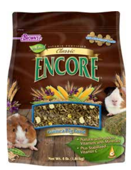
Guinea Pig Food