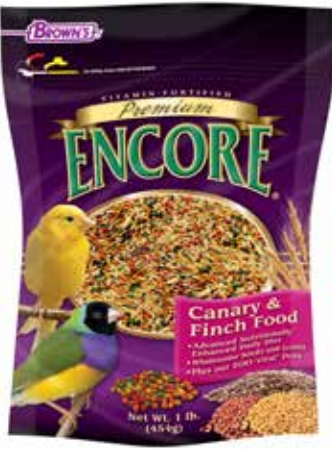
Canary & Finch Food