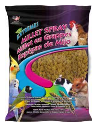
16 oz. Millet Spray

Millet Spray is a natural and delicious treat. It's fieldfresh and American-grown. All types of pets and wild birds relish our plump, sun-cured millet sprays!