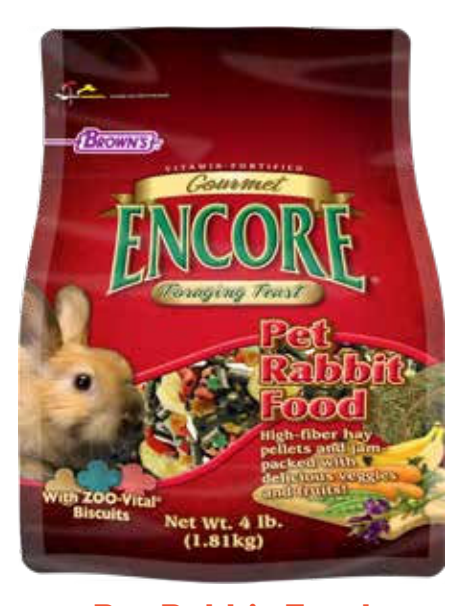
Pet Rabbit Food