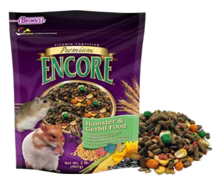
Hamster & Gerbil Food