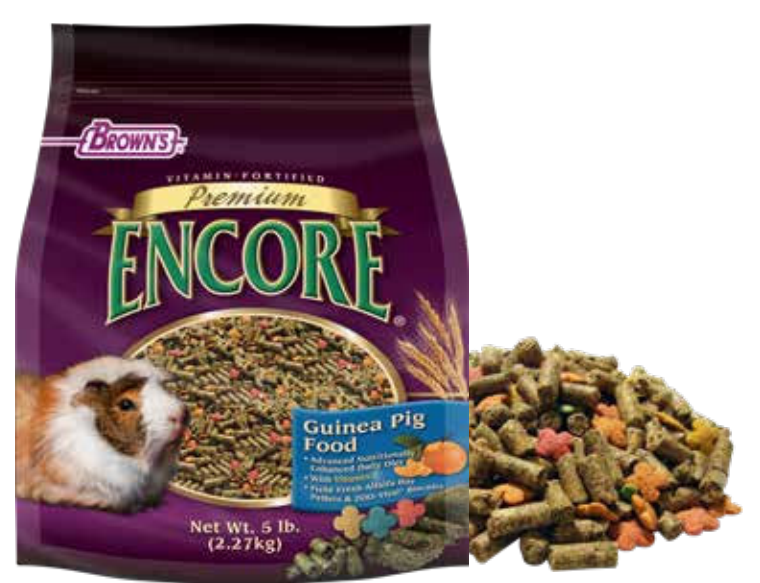
Guinea Pig Food