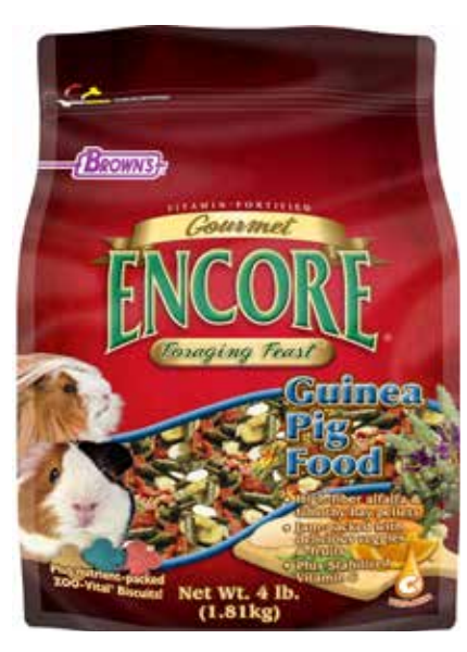
Guinea Pig Food