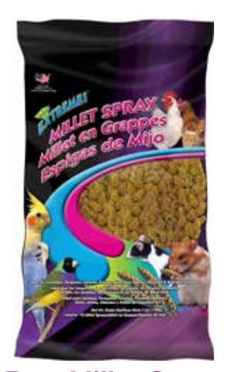
7 oz. Millet Spray

Millet Spray is a natural and delicious treat. It's fieldfresh and American-grown. All types of pets and wild birds relish our plump, sun-cured millet sprays!