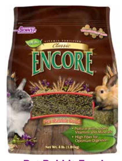
Pet Rabbit Food