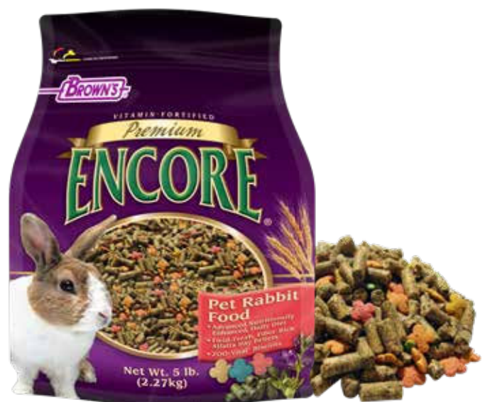
Pet Rabbit Food

Encore® Premium is a nutritionally enhanced daily diet with your companion pet's favorite foods. We use only natural preservatives plus we've added our vitamin-packed Zoo•Vital® biscuits that come in fun shapes, sizes, colors and textures... making this a stimulating diet your pets will simply love!