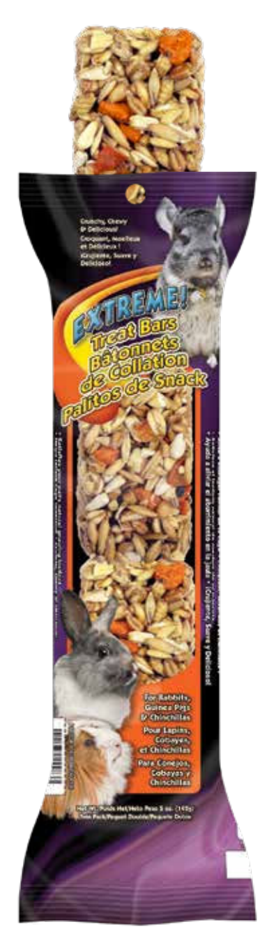
Treat Bars Twin Pack