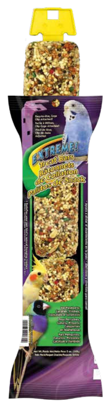
Treat Bars Twin Pack

Extreme!™ Treat Bars are so irresistibly tempting your pet bird or small animal will surely want more! Our nutritious treat bars are jam packed with delicious wholesome fruits, nuts, seeds, grains and veggies birds and small animals of all sizes will love to eat! Plus these treat bars stimulate the natural foraging instinct and help relieve cage boredom.