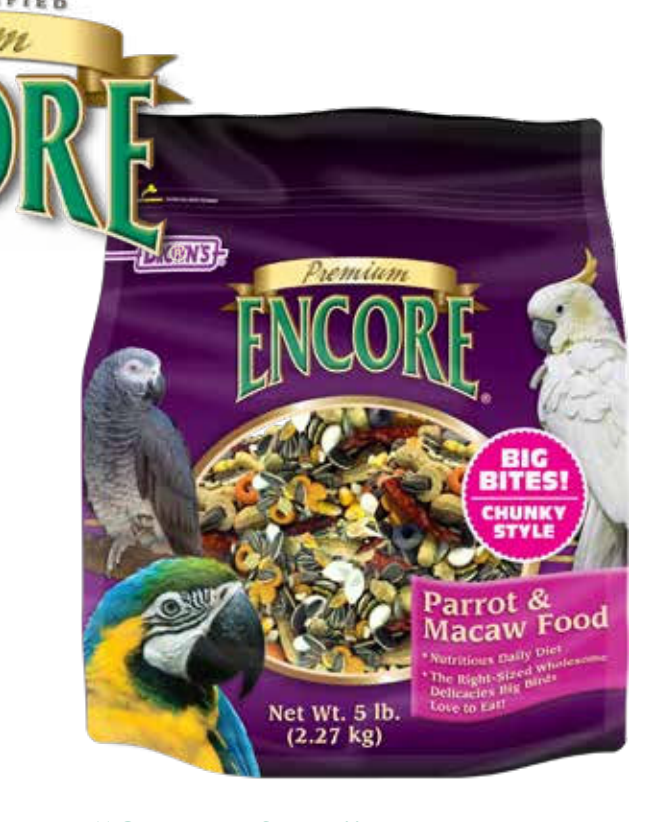
"Chunky Style" Parrot Food